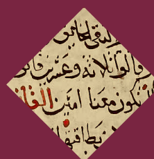
Middle (Christian) Arabic