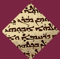
Classical Syriac (Eastern)

Introductory language courses accompanied by orientation sessions (principal sources, major editions, manuscripts, library/archive collections, dictionaries, periodicals) and exercise sessions in calligraphy